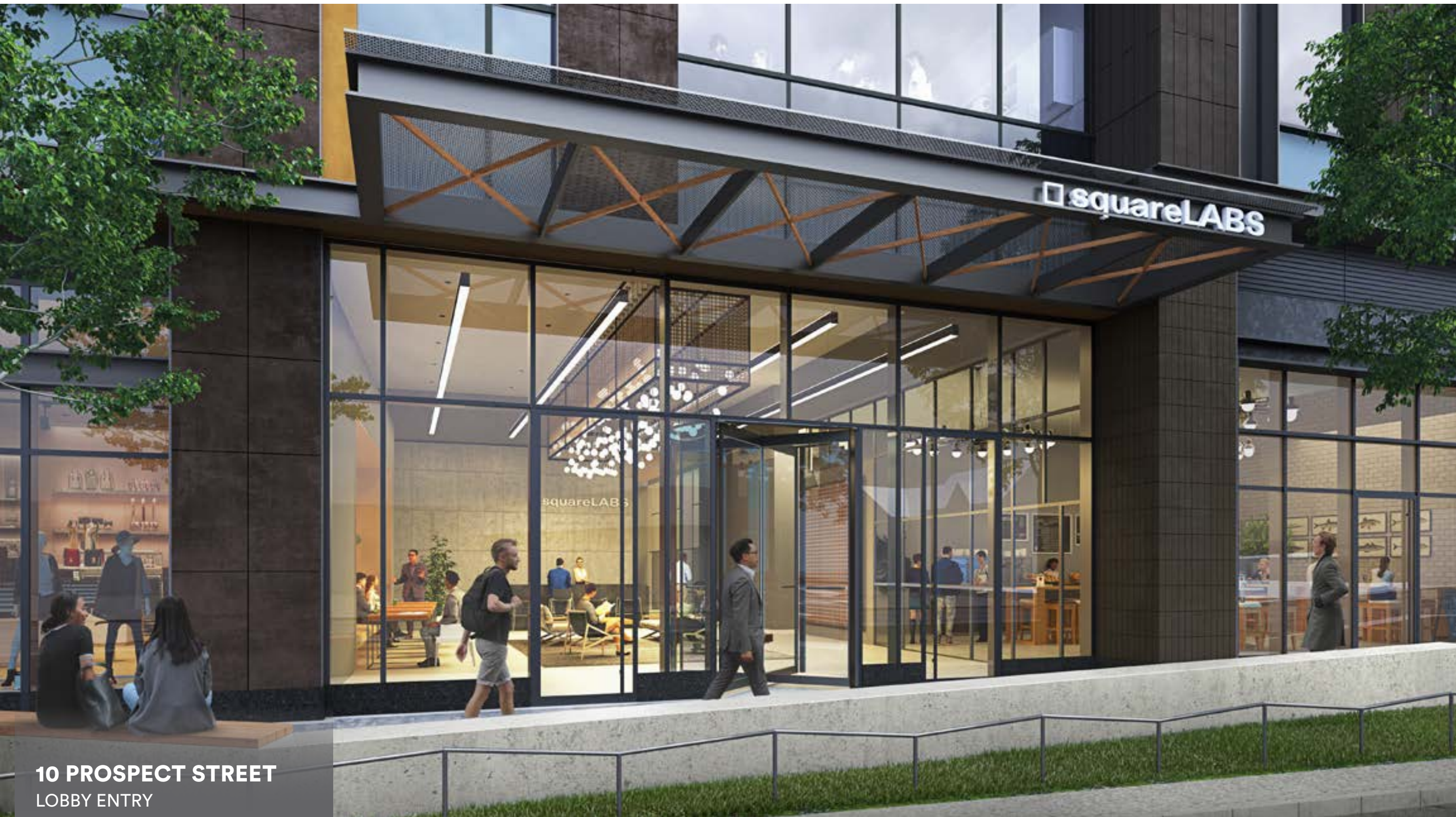
10 PROSPECT STREET LOBBY ENTRY